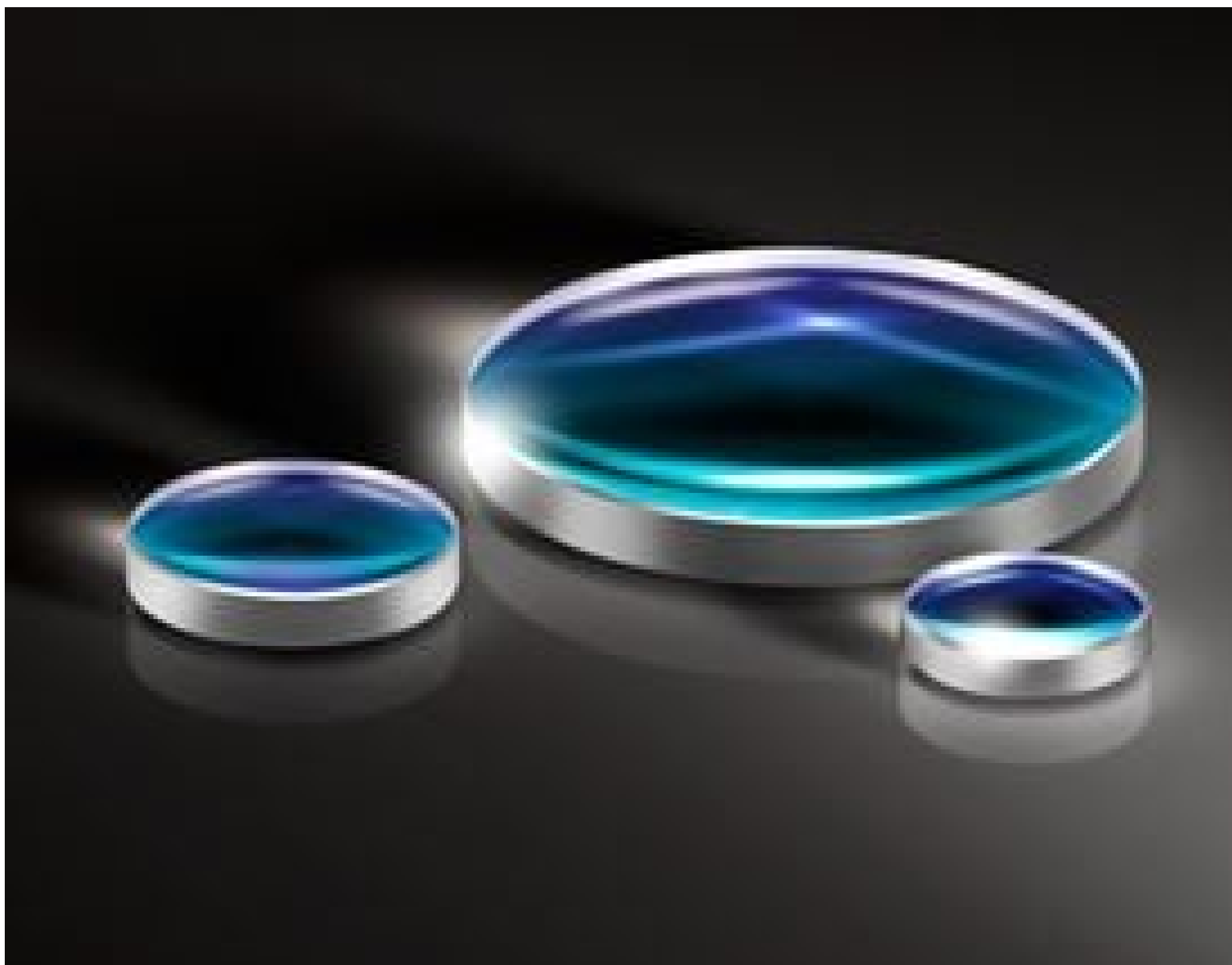
UV Fused Silica Double-Convex (DCX) Lenses