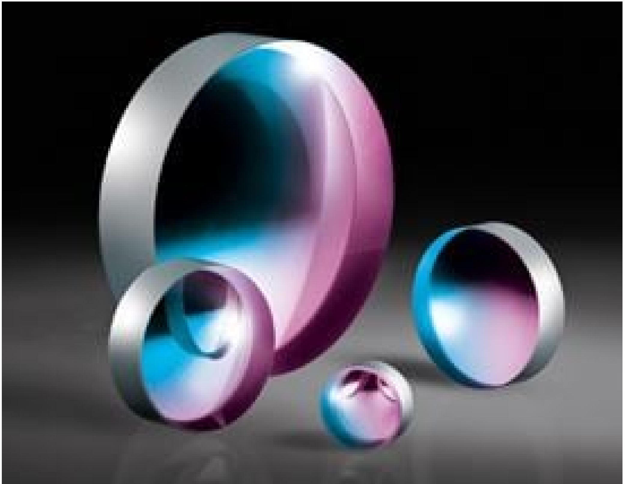
UV Fused Silica Plano-Concave (PCV) Lenses